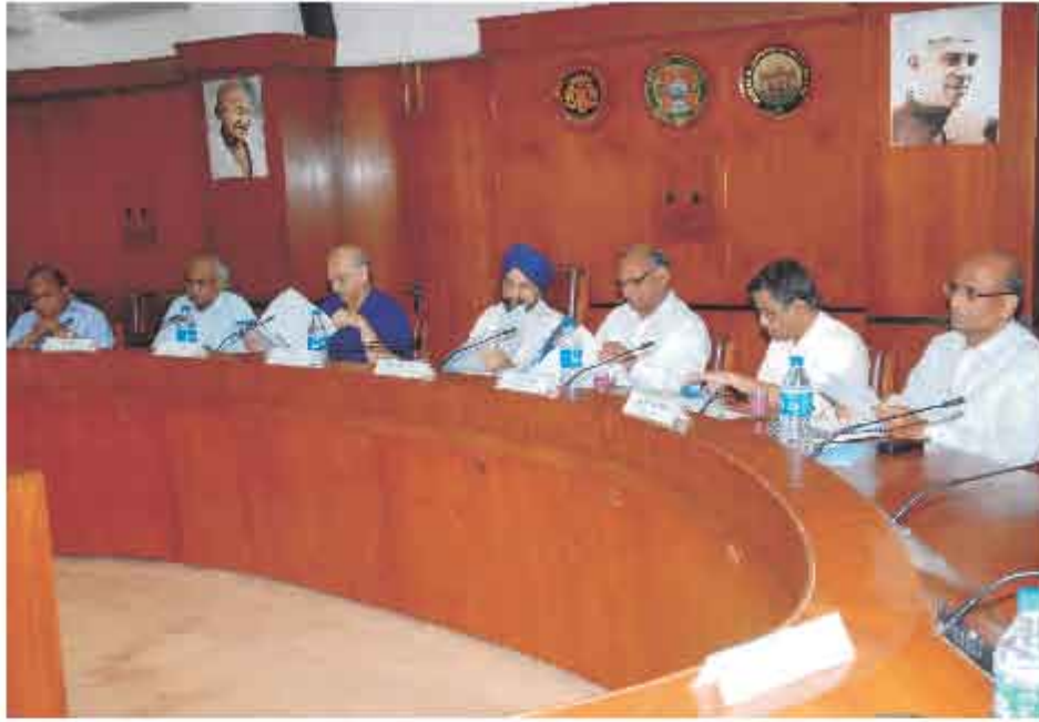
22nd Annual General Meeting - Shareholders