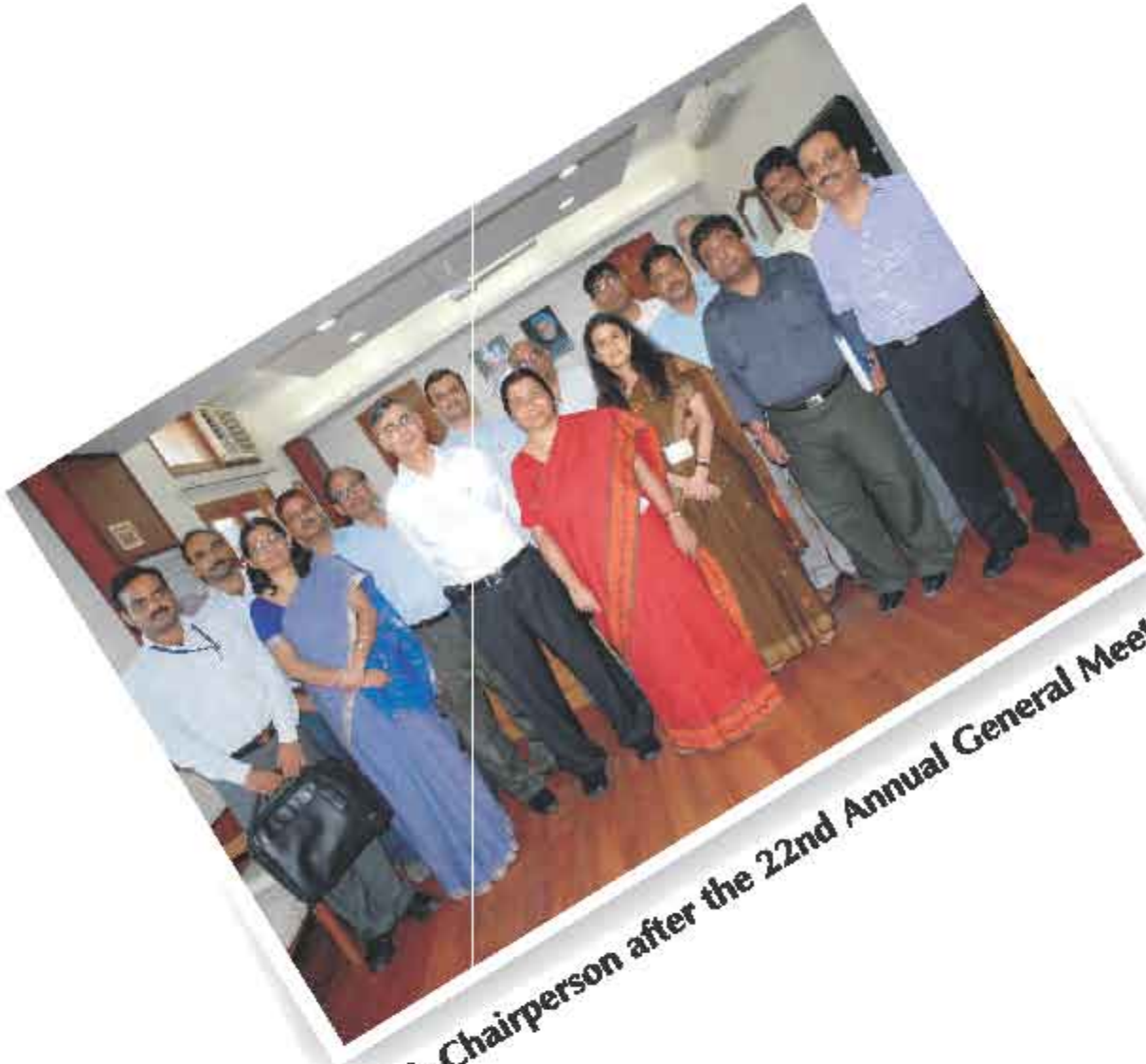
With Chairperson after the 22nd Annual General Meeting