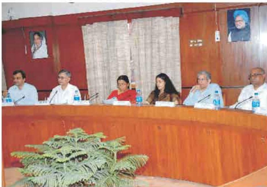
22nd Annual General Meeting - Board of Directors